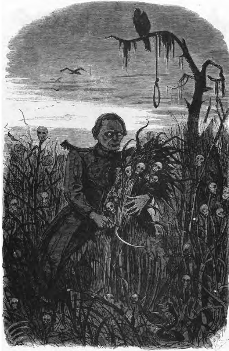
JEFF DAVIS REAPING THE HARVEST.

From a recent book about the American Civil War.